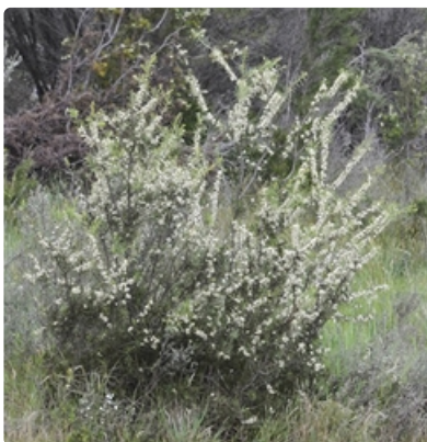
Shrub (subsp. teretifolia ). SE of Tarago