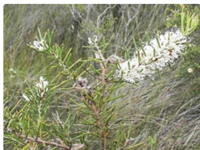
Flowering branches with 'nuts' (subsp. hirsuta ).