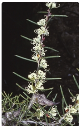
Flowering stem with 'nuts'. (subsp. teretifolia ). Photographer Don Wood, Morton National Park