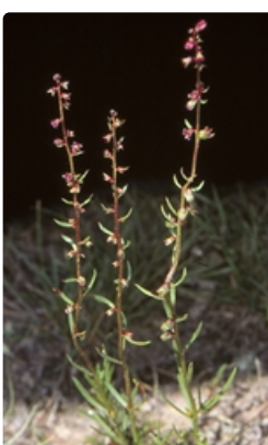
Plants with flowers and seed cases. Photographer Don Wood, Mulligans Flat Nature Reserve, ACT