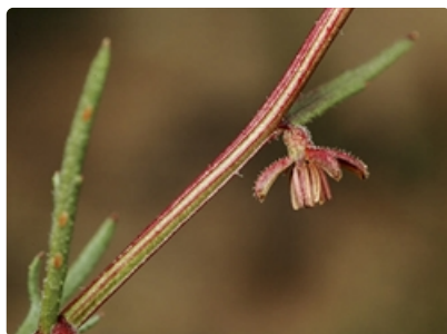
Male flower and leaf. Australian Plant Image Index, photographer Murray Fagg, Gundary Reserve east of Goulburn