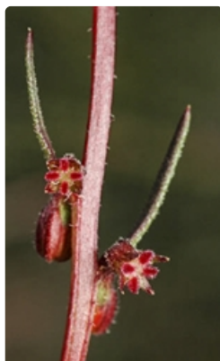
Female flowers and leaves. Gundary Reserve east of Goulburn