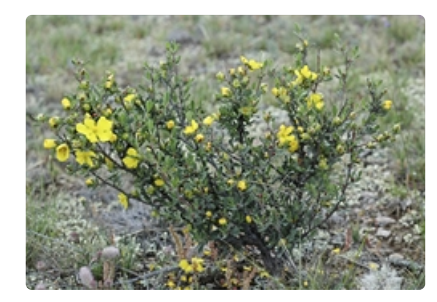
Shrub. Australian Plant Image Index, photographer Murray Fagg, Scottsdale Bush Heritage Reserve near Bredbo