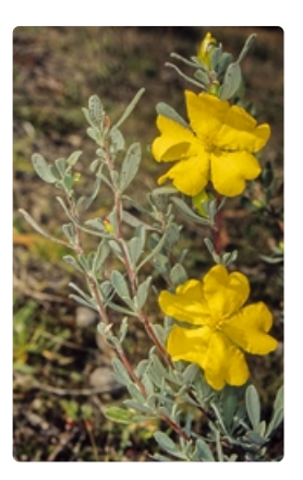
Flow ering branches. Tidbinbilla Nature Reserve, ACT