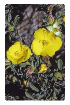
Flowers, buds, and leaves. Bermagui Council Reserve south of Bermagui