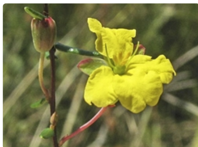
Flower and bud. Barren Grounds Nature Reserve west of Kiama