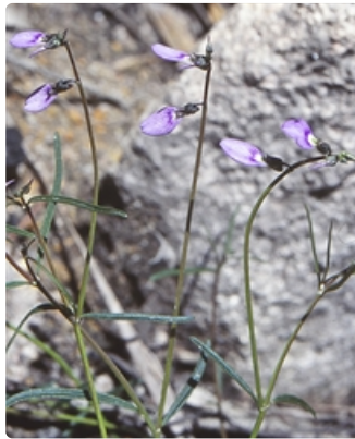
Flowering stems. Dr George Mountain near Bega