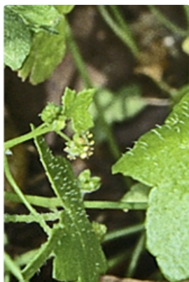
Flower clusters and leaves. Photographer Don Wood, Carnarvon Station Bush Heritage Reserve via Augathella, Qld