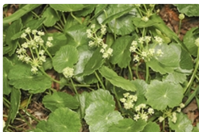
Flower clusters and leaves. near The Entrance, NSW