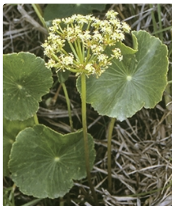
Flower cluster and leaves. Comerong Island near Nowra