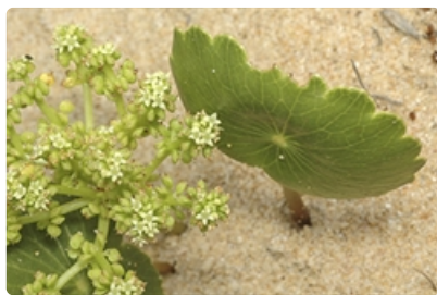
Flower cluster and leaf. south of Bermagui