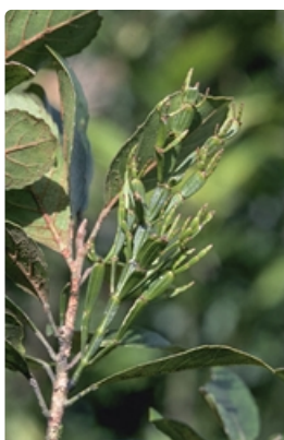
Plant on host. Australian Plant Image Index, Australian Tropical Rainforest key, unknown photographer