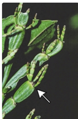
Flowering stems. Arrow points to flowers.