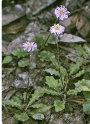
Flowering plants. Ben Boyd National Park south of Eden