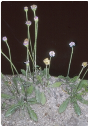
Flowering plants. Tidbinbilla Nature Reserve, ACT