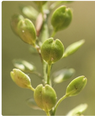
Seed cases. Photographer Bart Wursten, Zimbabwe