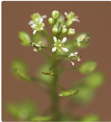
Flowers. Photographer Bart Wursten, Zimbabwe