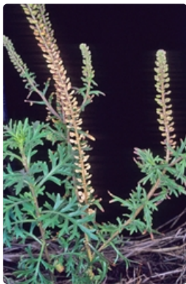
Flowering and seeding plant. Photographer Don Wood, Carnarvon Station Bush Heritage Reserve via Augathella, Qld