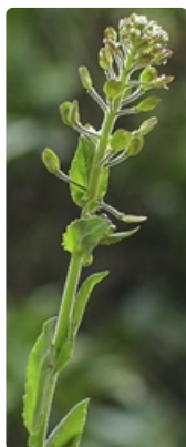
Flowering and fruiting stem. Photographer Jackie Mles, Charlotte Pass