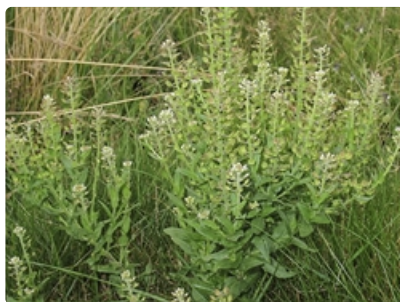
Plant. Photographer Jackie Mles, Charlotte Pass