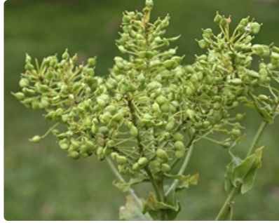
Seed cases. near Bacchus Marsh, Vic