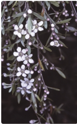
Flowering branches. Nerrigundah, west of Bodalla