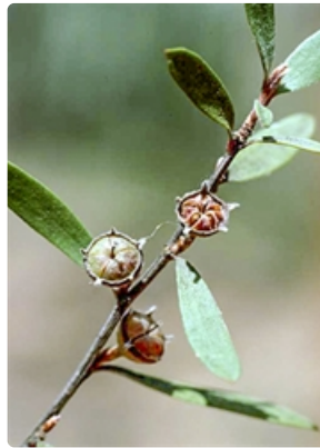
Young nuts and leaves.