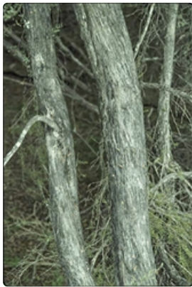
Trunks. Cotter Reserve, ACT