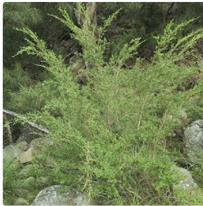
Shrub. Brogo, north of Bega