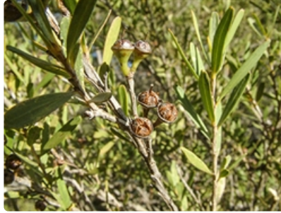
Young nuts and leaves. Wollemi National Park, west of Sydney