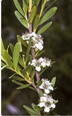
Flowering branch. Mungerie State Forest, west of Mbruya