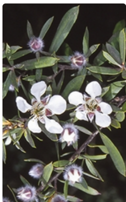
Flowers, nuts, and leaves. Namadji National Park, ACT