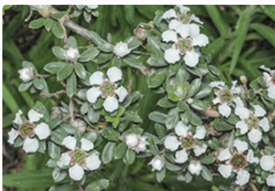
Flowering branches.