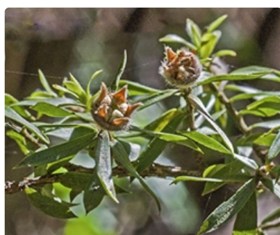
Young nuts and leaves. Macedon Ranges, Vic