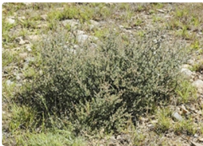
Shrub. Tantangara Dam, Kosciuszko National Park