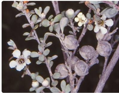
Flowering branches with nuts. Mongarlowe east of Braidwood