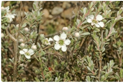
Flowering branch. Australian Plant Image Index, photographer Murray Fagg, Tantangara Dam, Kosciuszko National Park