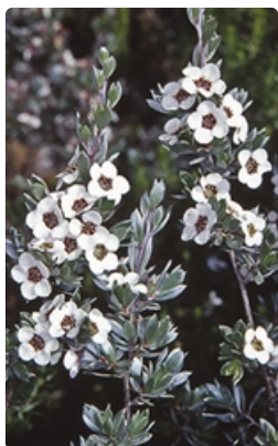
Flowering branches.