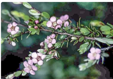
Flowering branches. Yaouk Peak south west of the ACT