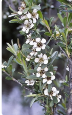
Flowering branches. Naas River crossing, ACT