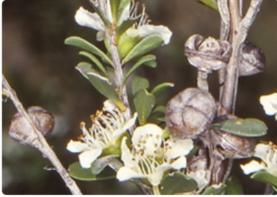
Flowering branches with nuts. Countengary east of Coorra