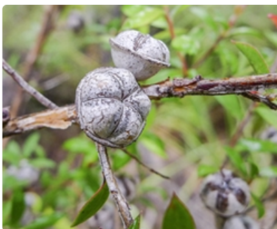
Nuts. Lune River, Tas