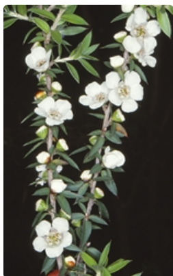
Flowering branches. Nadgee State Forest near Eden