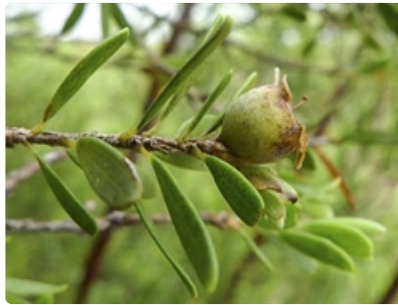
Young nut on branch. Waterfall, Sydney