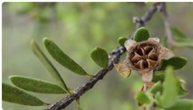
Open nut on branch. Waterfall, Sydney