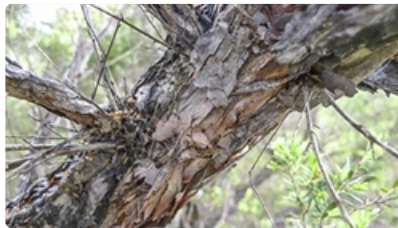
Trunk. Waterfall, south of Sydney