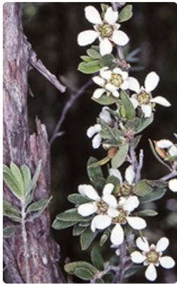
Flowering branch and trunk. Yurramie State Forest, west of Merimbula