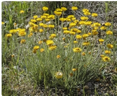
Clump (subsp. albicans ). between Bathurst and Bungendore