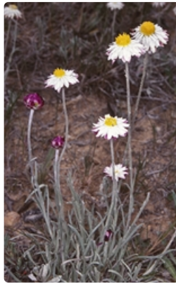
Flowering plant (subsp. tricolor ). east of Cooma