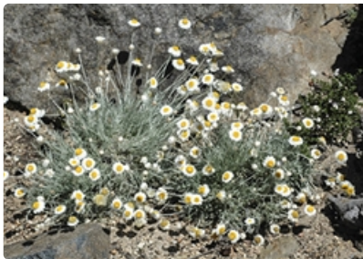
Flowering plants (subsp. tricolor ).