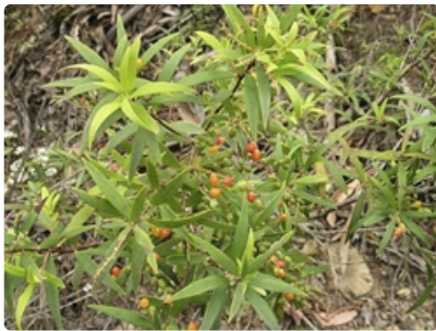
Fruiting branches.