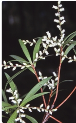
Flowering branches. Badja State Forest, NE of Cooma