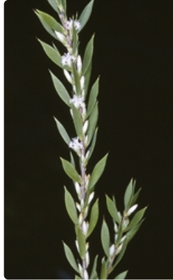
Flowering stems. Booderee National Park, Jervis Bay Territory