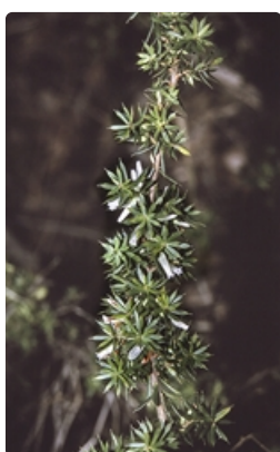
Flowering branch.