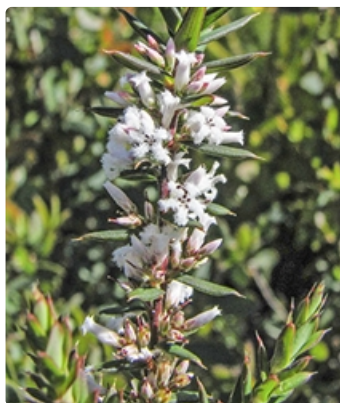
Flowering branch. Wilsons Promontary, Vic