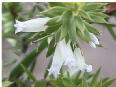
Flowers and leaves.