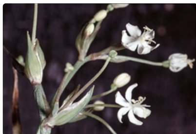
Flower cluster.