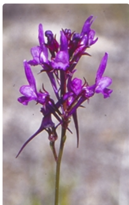
Flowering stem. Photographer Don Wood, Mt Tennent, Namadji National Park, ACT