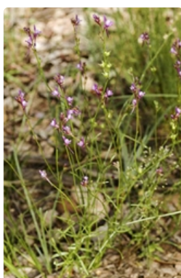
Flowering plants. Mulligans Flat Nature Reserve, ACT