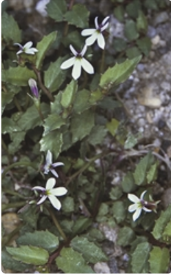
Flowering plant. north of Bodalla