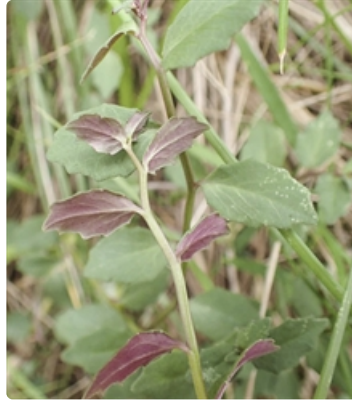
Backs of leaves.