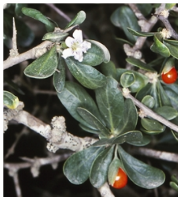
Flowering and fruiting stems. Potato Point, east of Bodalla