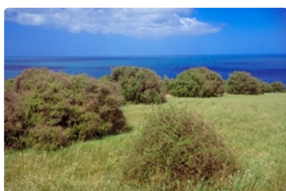
Shrubs. Kangaroo Island, SA