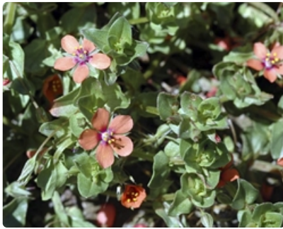
Flowering stems. Gooyoyaroo Nature Reserve, ACT