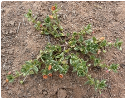
Flowering plant. Scotia Sanctuary, western NSW