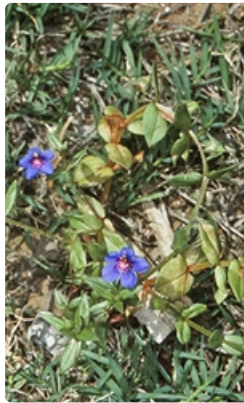
Flowering plant. Murrumbidgee National Park north of Batemans Bay