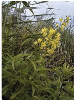
Flowering stem.