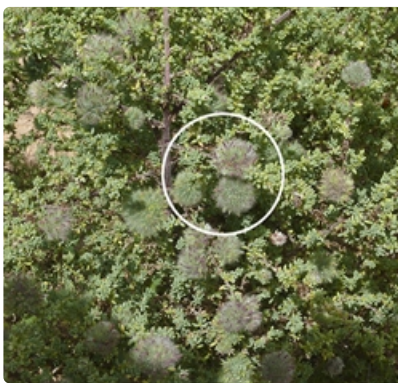
Cancerous growths (three circled). Photographer Don Wood, Scotia Sanctuary, western NSW