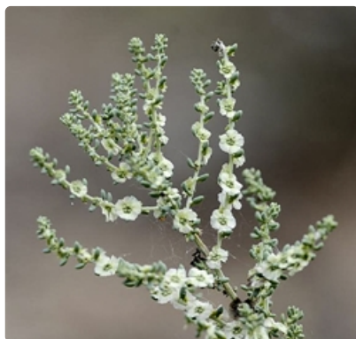
Seed cases on branches. Photographer Chris Clarke, Parr Scrub Reserve, Pinaroo, SA