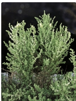
Top of shrub. Scotia Sanctuary, western NSW