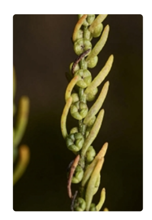
Stemwith wingless seed cases. Carnarvon National Park, Qld