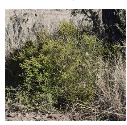
Shrub. Carnarvon National Park