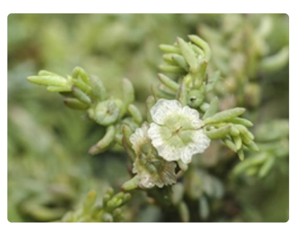
Winged seed case. Eurabba State Forest Nof Tempra