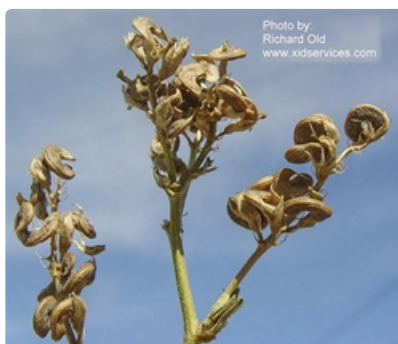
Rods.