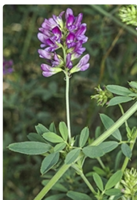
Flowers and leaves.