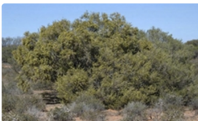
Shrub. unknown place