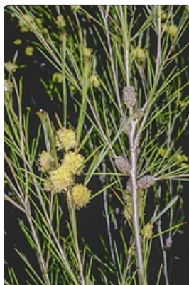
Flowering stem and stem with seed cases.