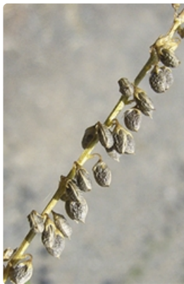
Pods on stem. Photographer Zoya Akulova, California, USA