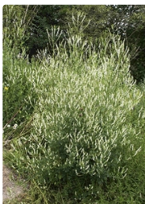
Flowering plant. Photographer Mark Hyde, Zimbabwe