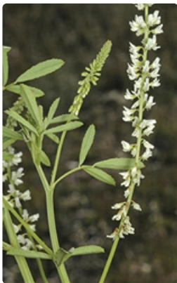
Flowers and leaves. between Queanbeyan and Haskinstown