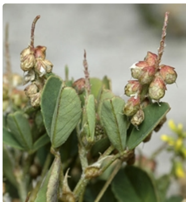
Pods and leaves. Lake George