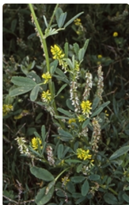
Flowering stem. beach north of Depot Beach