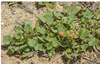
Plant. Australian Plant Image Index, photographer Murray Fagg, near Hoskinstown