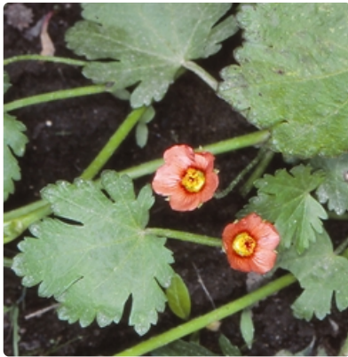
Flowers and leaves. Uriarra Crossing, Murrumbidgee River, ACT