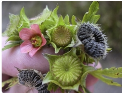
Flower and seed cases.