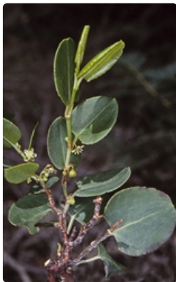
Flowering branch with male flowers. Ben Boyd National Park north of Eden