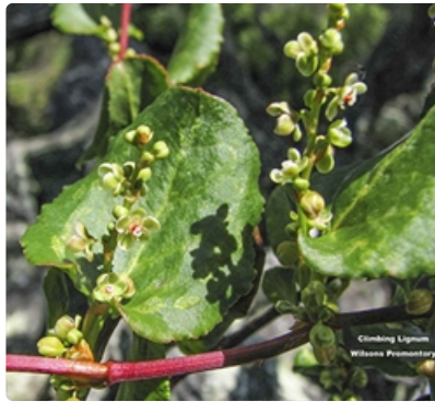
Flowering branch with female flowers. Wilsons Promontory, Vic