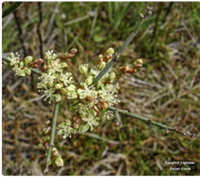
Flowering branch with male flowers.