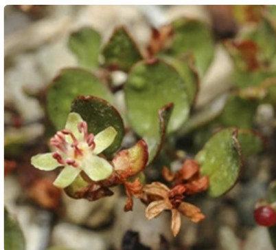
Male flowers and leaves. Australian Plant Image Index, photographer Murray Fagg, Bredbo