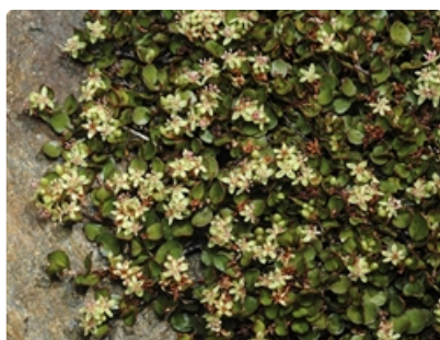
Flowering mat.