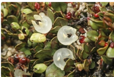
Leaves and fleshy fruit. Australian Plant Image Index, photographer Murray Fagg, Kosciuszko National Park