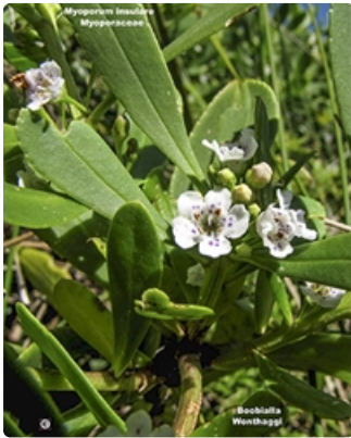
Flower cluster and leaves.