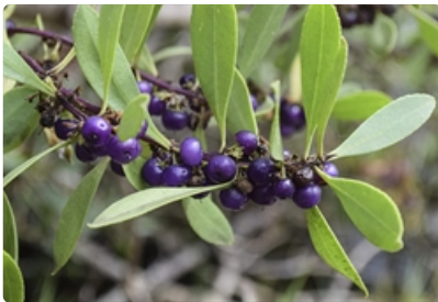
Fruiting stem. near Wannambool, Vic