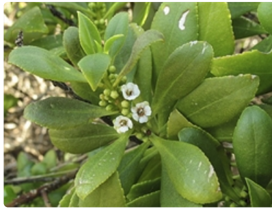
Flower cluster and leaves.