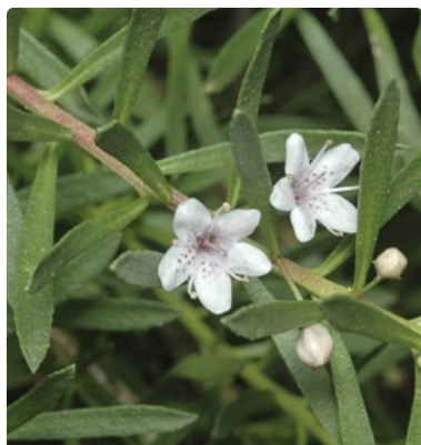
Flowers and leaves.