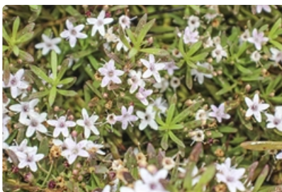
Flowering carpet. Photographer Arthur Chapman, near Underbool, western Vic