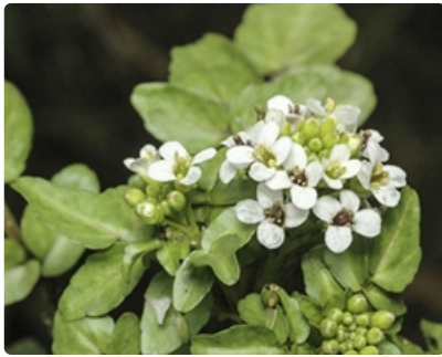
Flowers and leaves. near Candelo