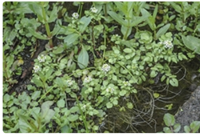
Flowering plant. near Candelo