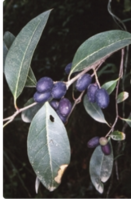
Fruiting branch. Photographer Don Wood, Potato Point east of Bodalla