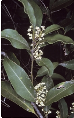
Flowering branches. Tathra Wildlife Reserve near Tathra