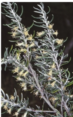
Flowering branches. Barragoot Lake south of Bermagui