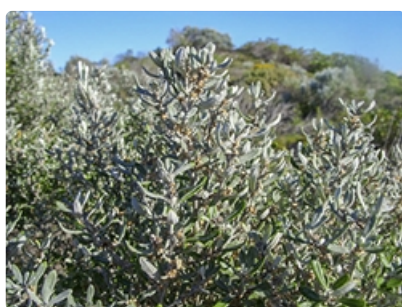
Shrub. Australian Plant Image Index, photographer AN Schmidt-Lebuhn, Cervantes, WA