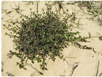
Plant. Bournda Beach, north of Merimbula, NSW