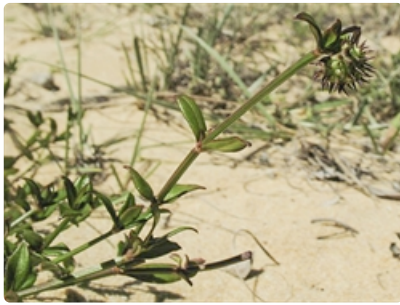
Flowering stem. Bournda Beach, north of Merimbula, NSW