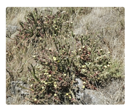
Plant. Australian Plant Image Index, photographer RGF Richardson, Little River, Vic?