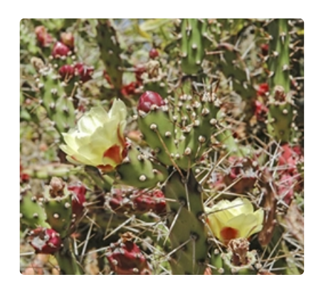
Flowering stems. Australian Plant Image Index, photographer RGF Richardson, Little River, Vic?