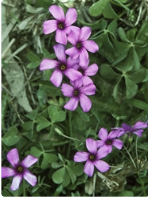
Flowers and leaves. Tantawangalo Mountain Road, east of the ACT