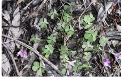
Flowering plant. Photographer Russell Best, Macedon Ranges, Vic