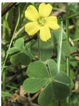
Flower and leaves.