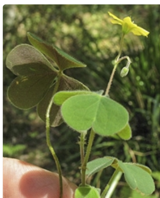
Flowering stem showing the back of a leaf.