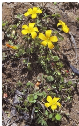
Flowering plant. Oallen Road east of Oallen Ford