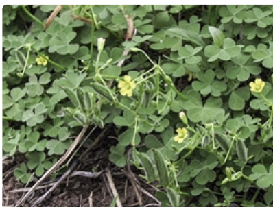
Carpet with flowers and seed cases.