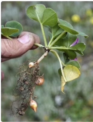
Plant with bulbs. Ararat to Halls Gap, Vic.