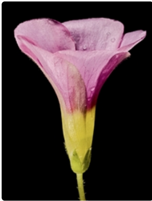
Flower. Australian Plant Image Index, photographer Kevin Thiele, WA