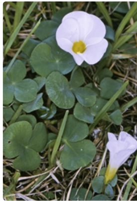
Flowers and leaves. Wallaga Lake, near Bermagui